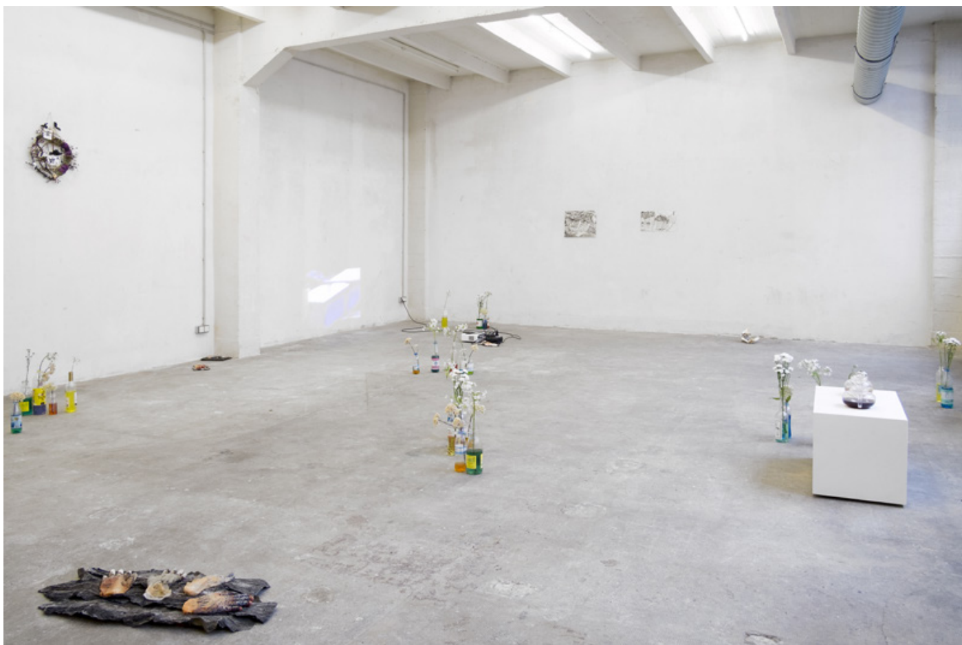
Пикник на обочине (Picnik na obochine), 2016