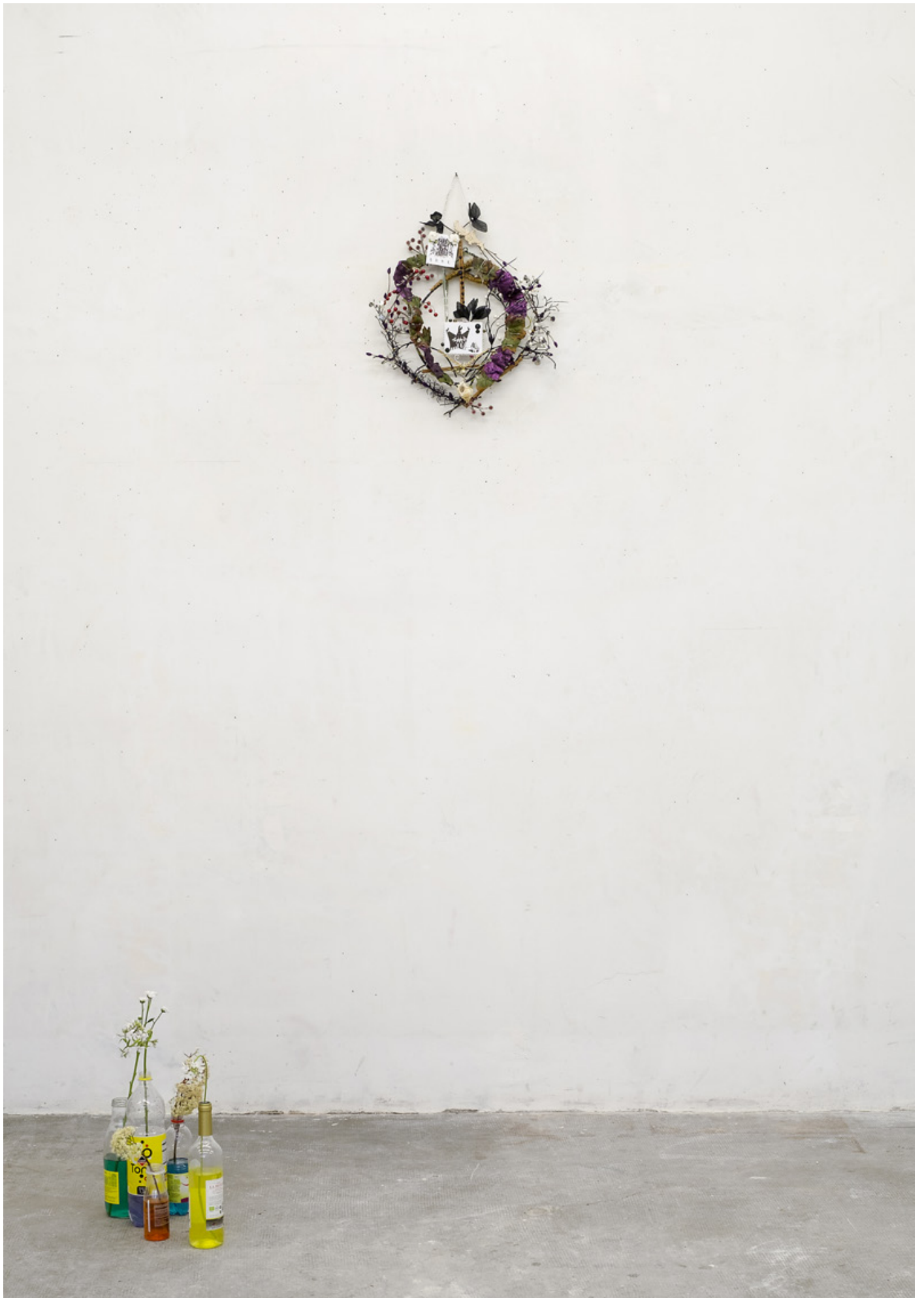
Пикник на обочине (Picnik na obochine), 2016