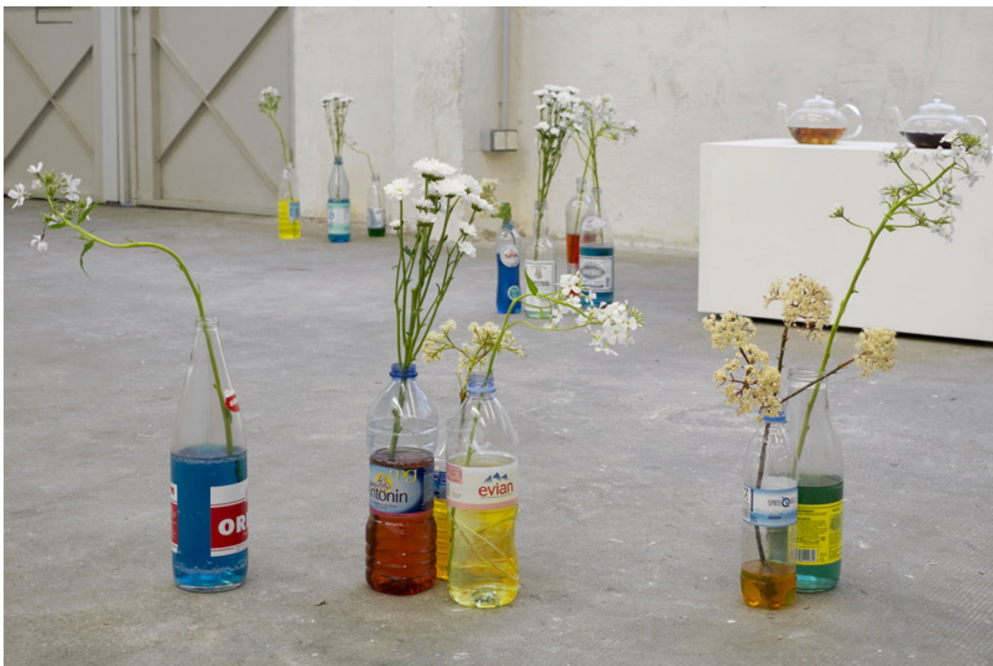
Пикник на обочине (Picnik na obochine), 2016