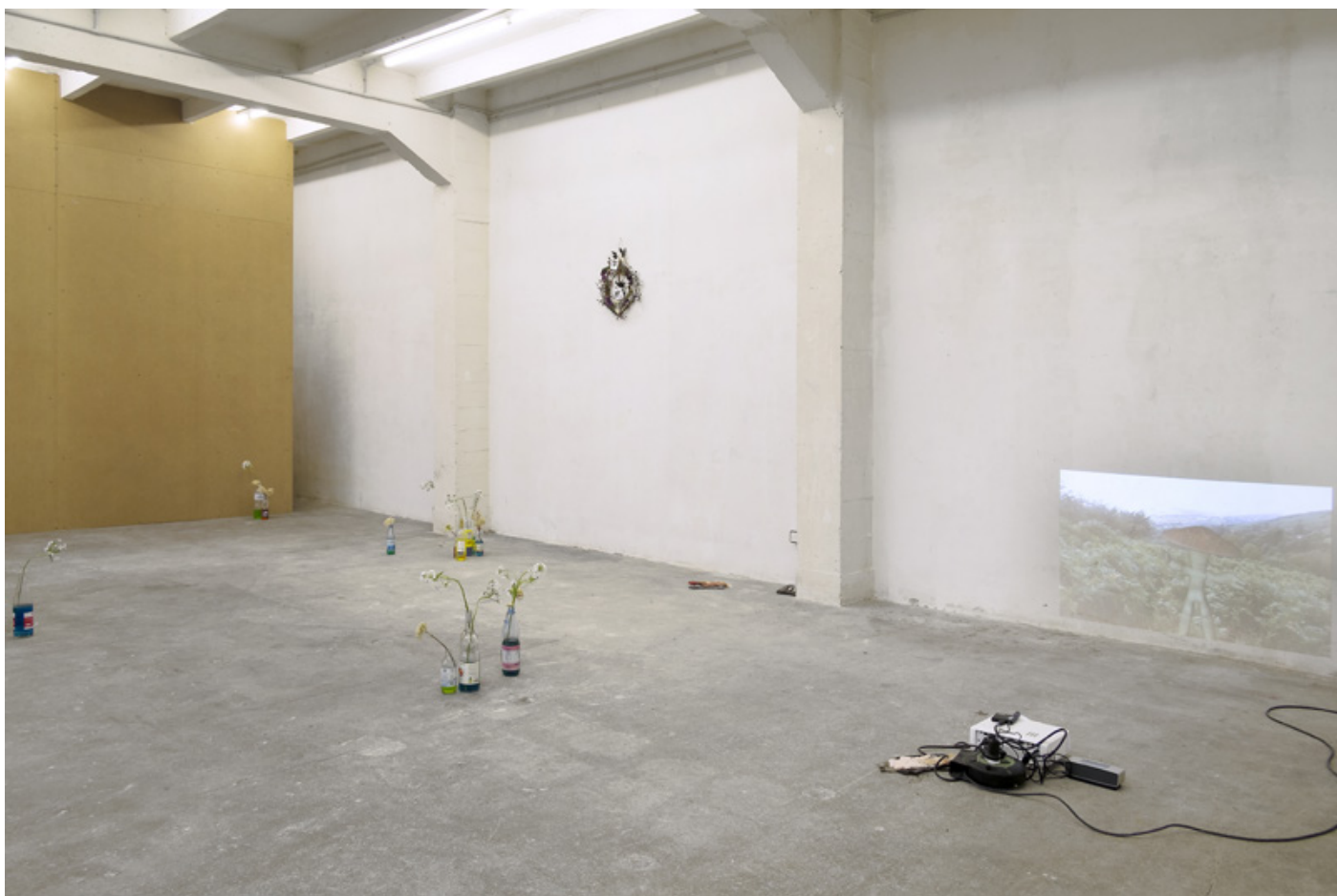
Пикник на обочине (Picnik na obochine), 2016