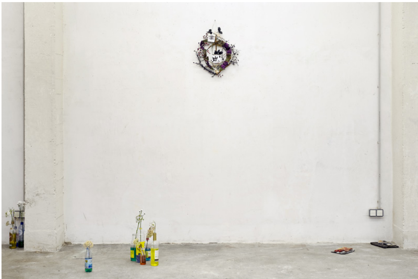
Пикник на обочине (Picnik na obochine), 2016