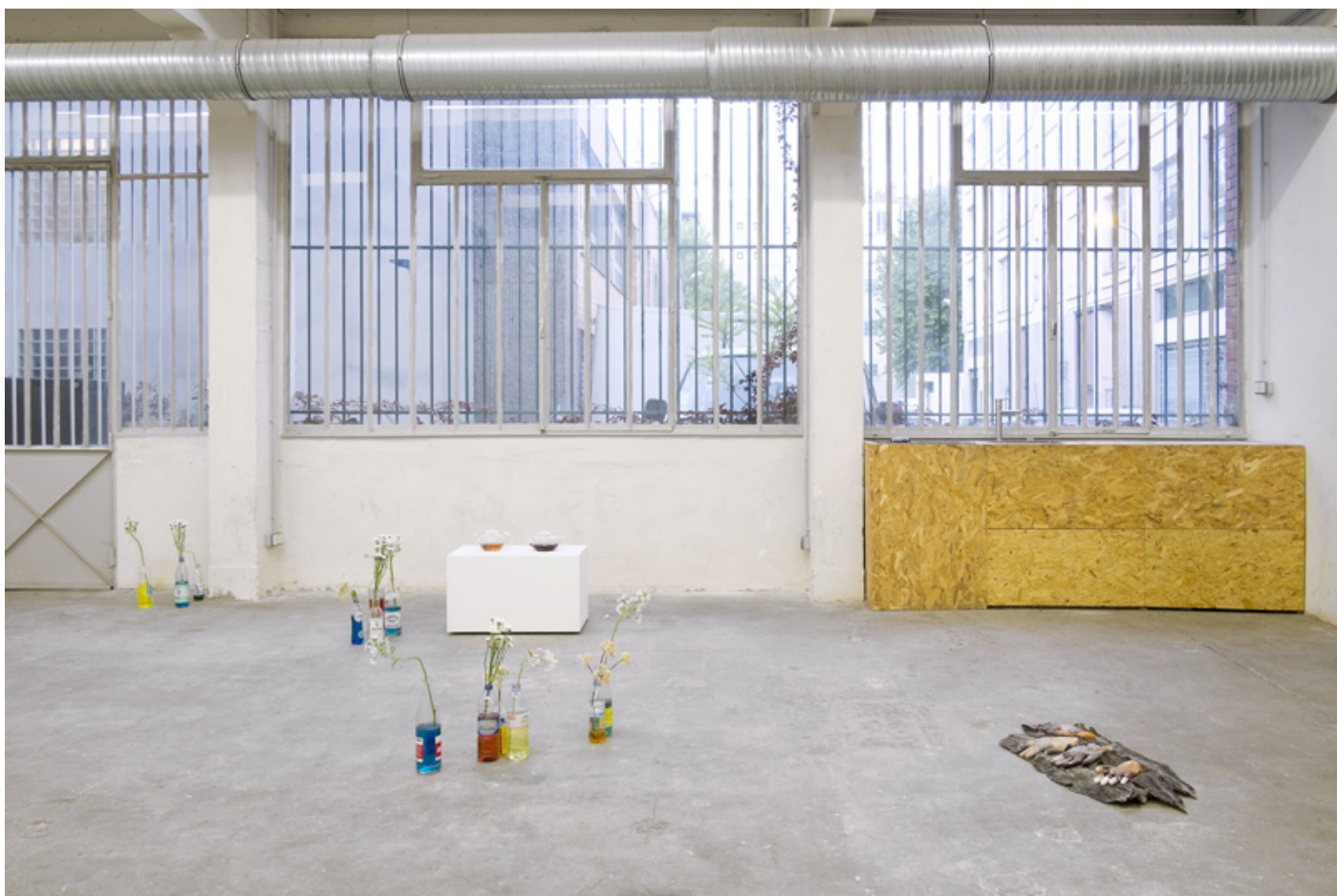
Пикник на обочине (Piknik na obochine), 2016