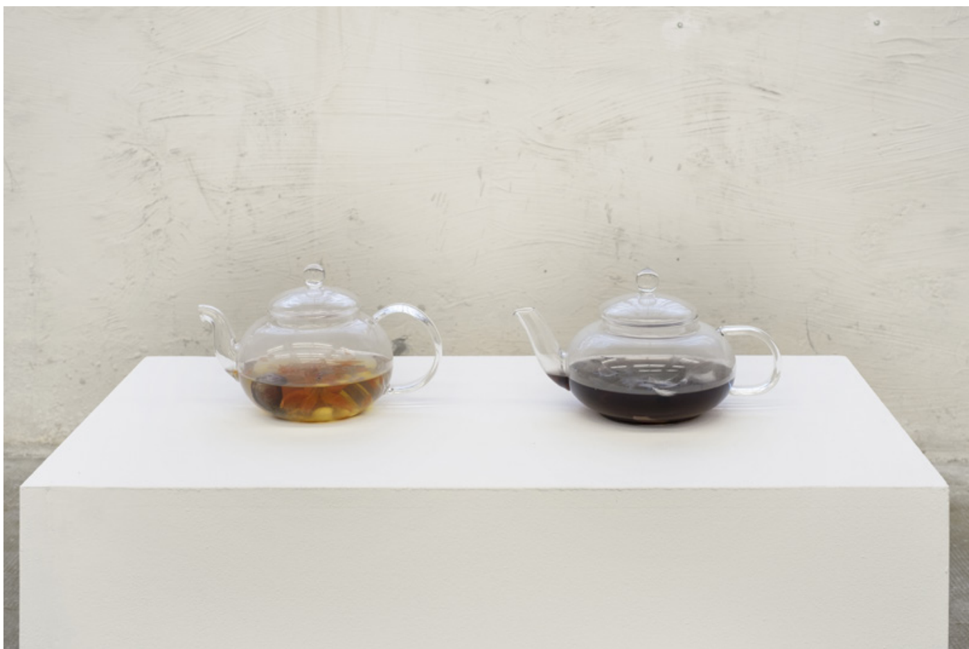
Пикник на обочине (Piknik na obochine), 2016