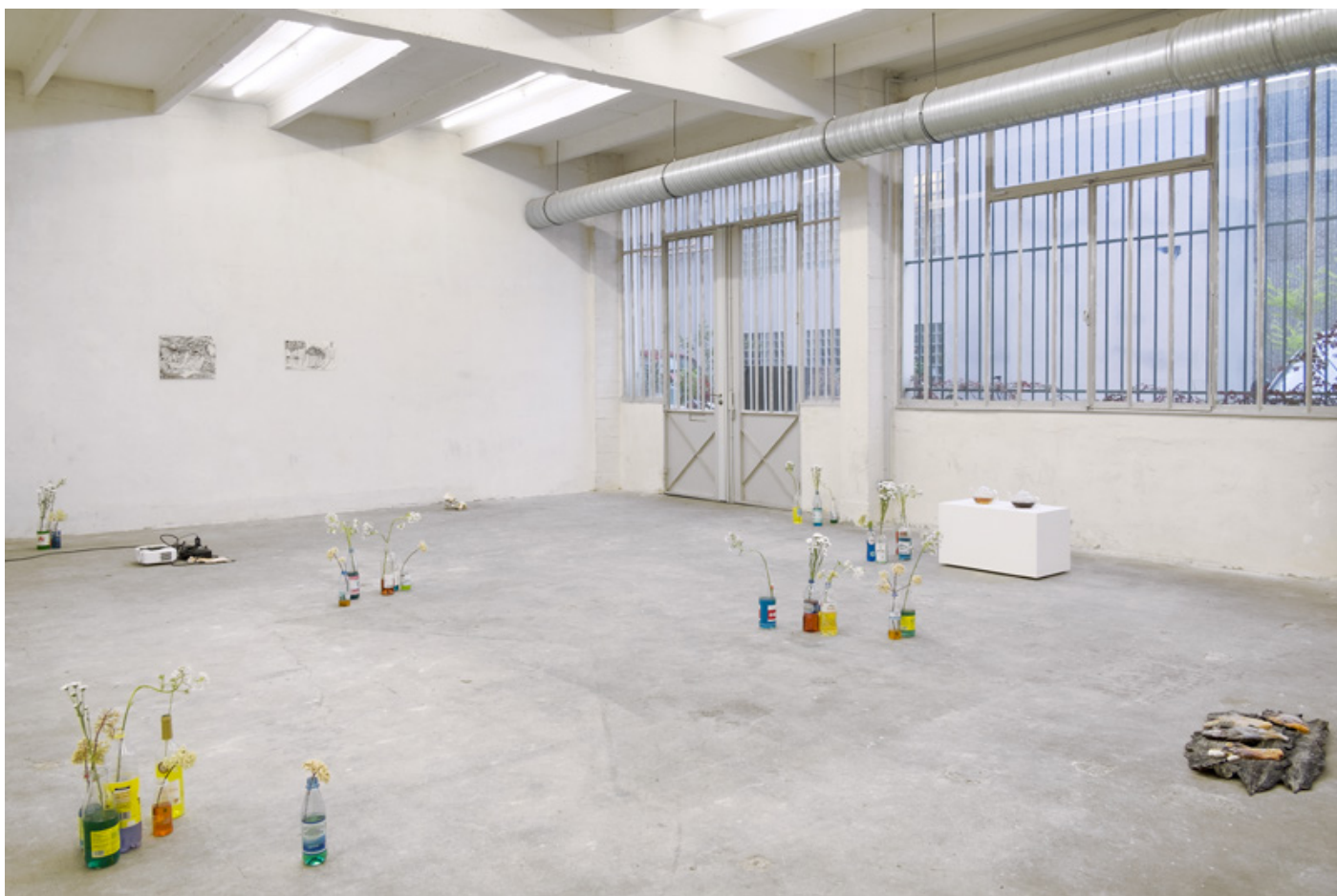
Пикник на обочине (Piknik na obochine), 2016