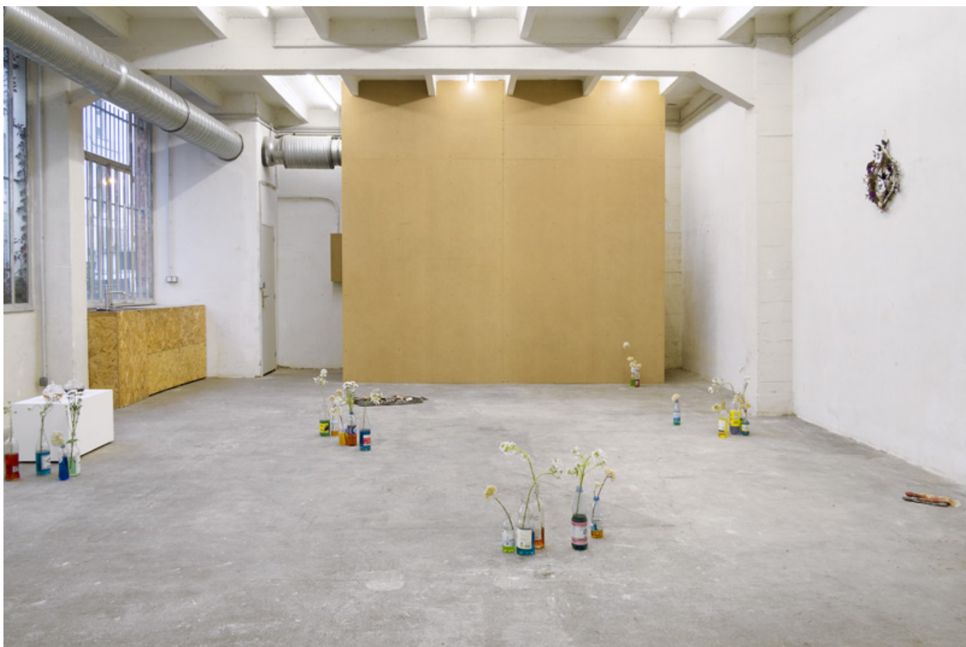
Пикник на обочине (Picnik na obochine), 2016